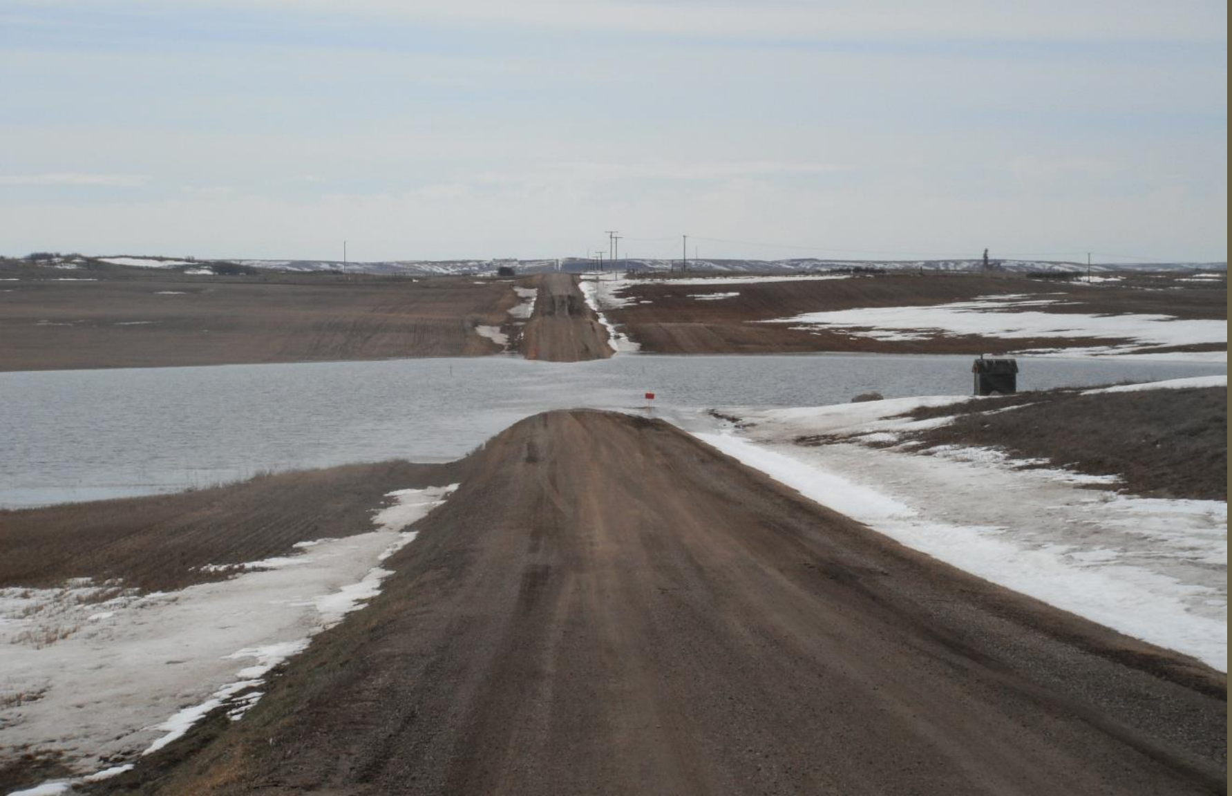
Stan Weston's road