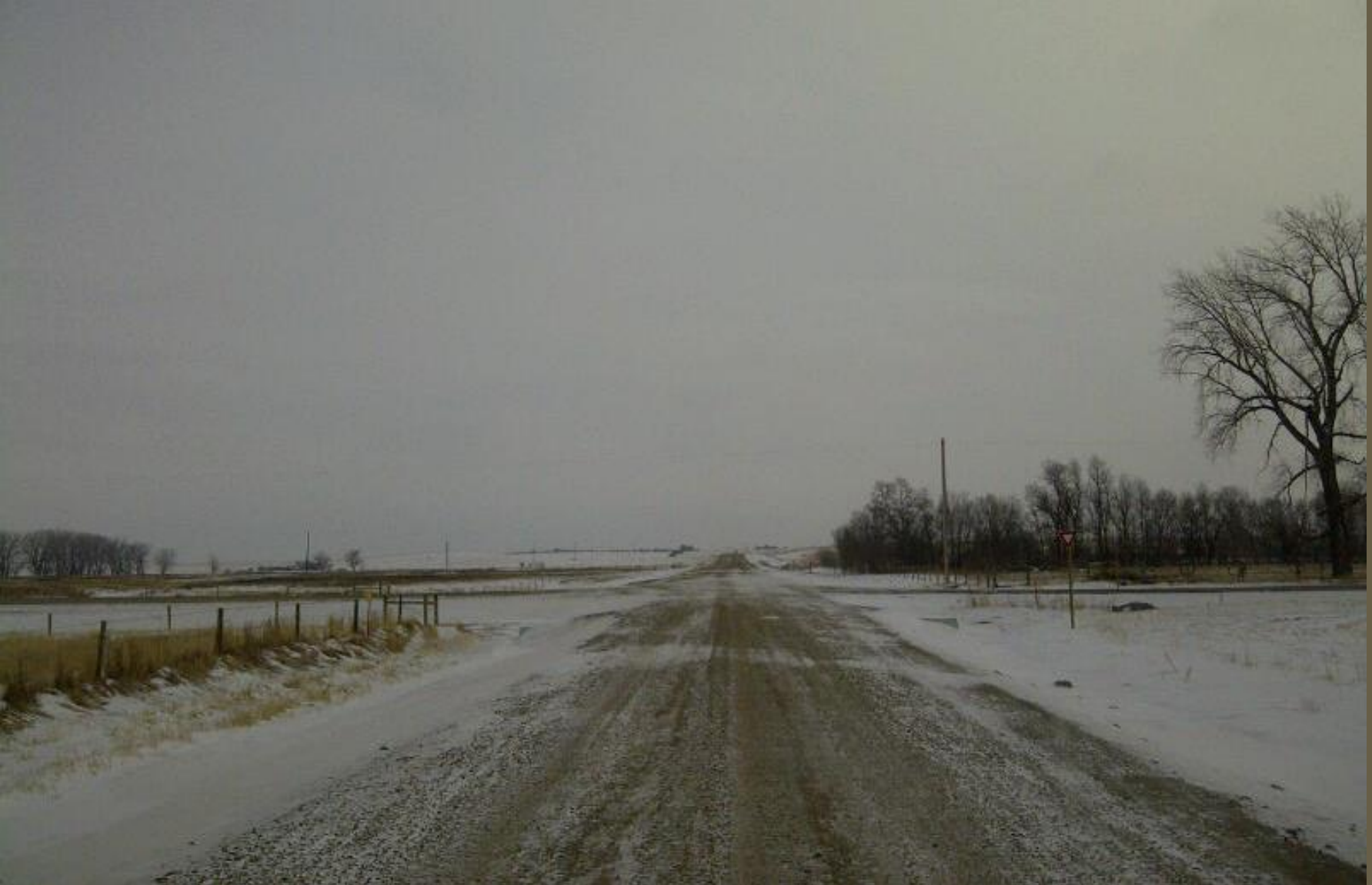
Looking East from West side of intersection South Boundary and Adlem