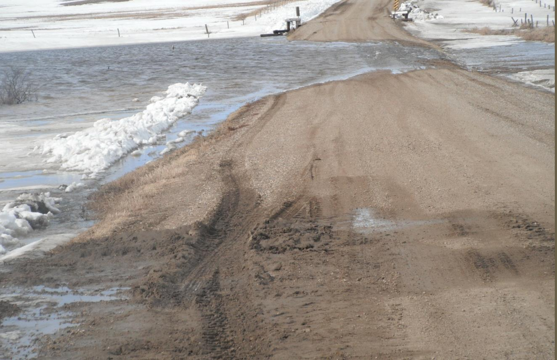
In Spring Bradley Bridge before construction