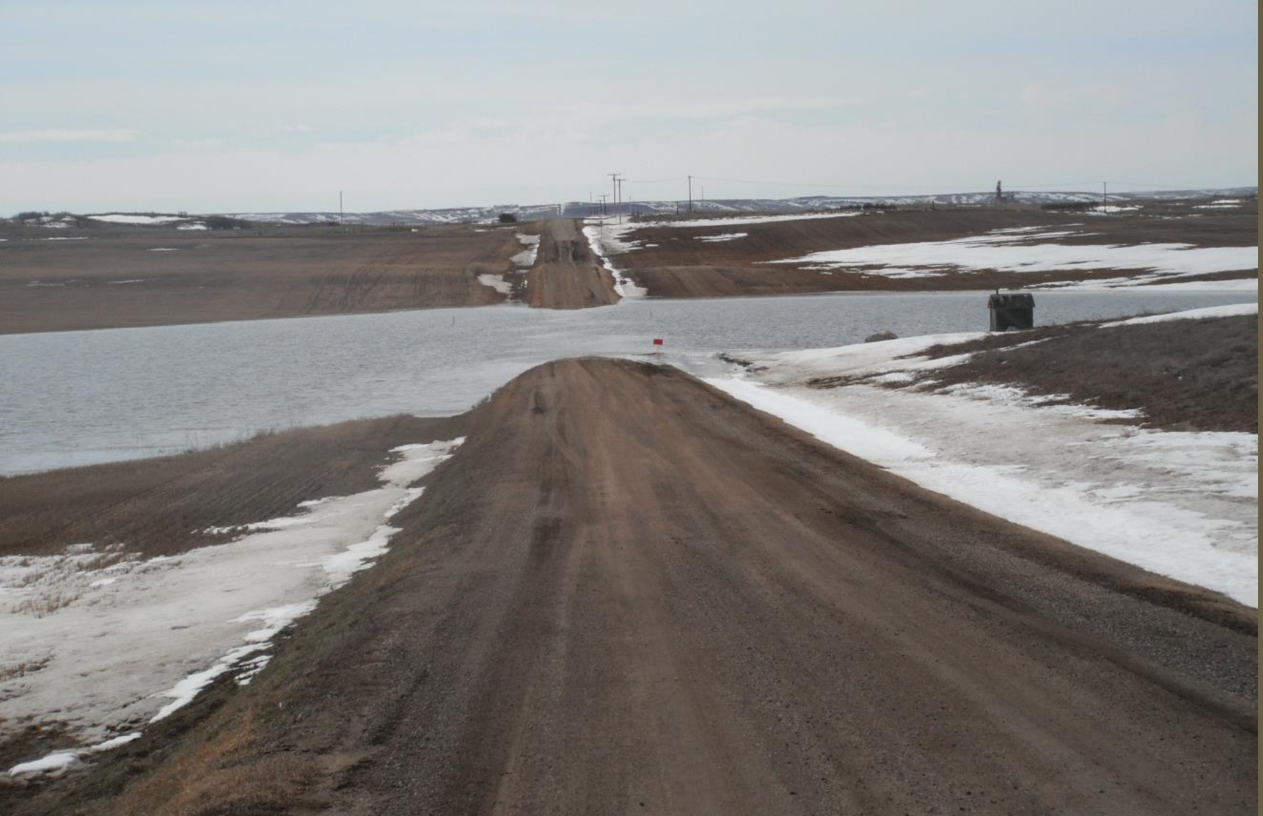
Stan Weston's road