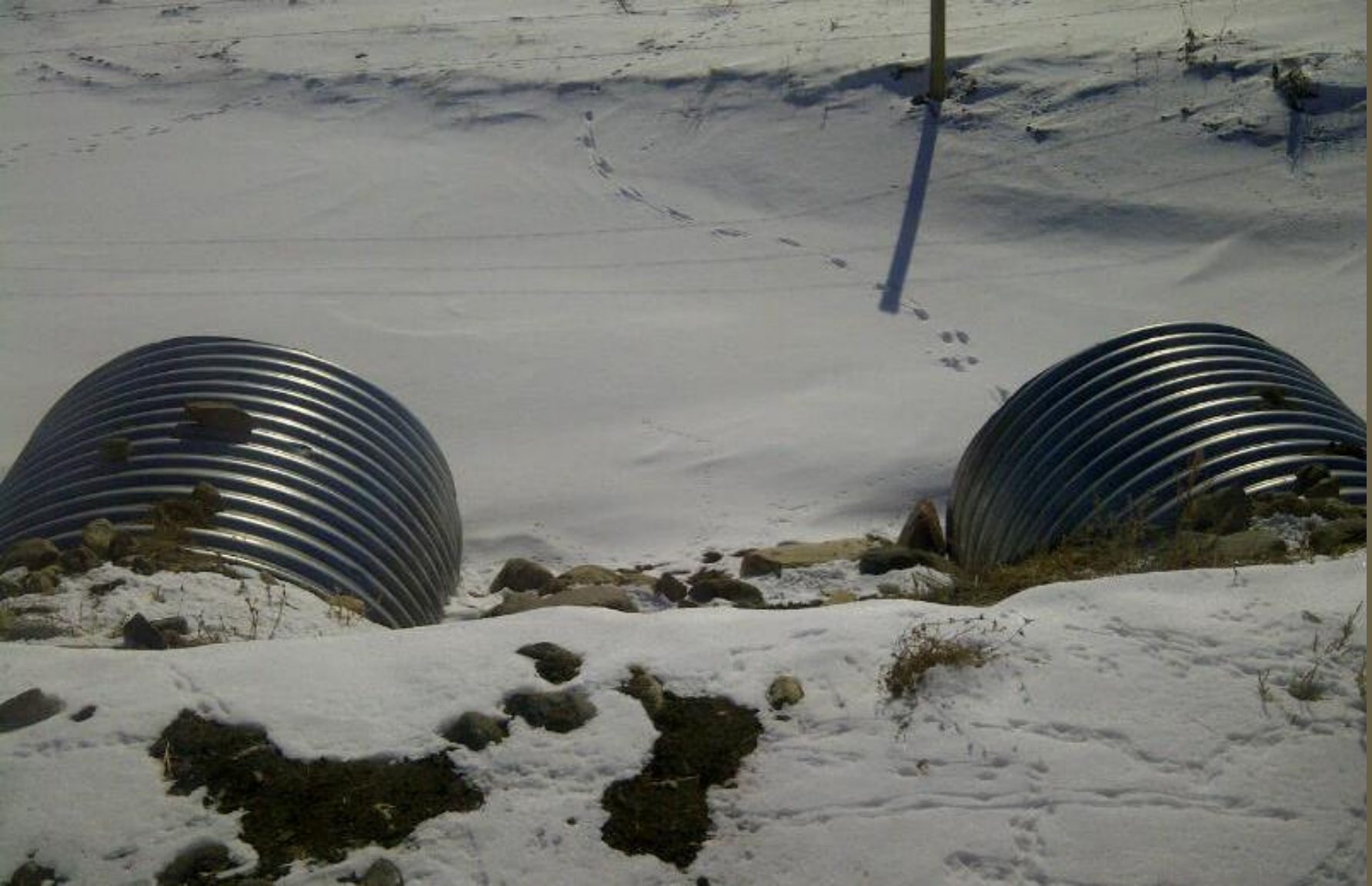
Installed culverts at Bradley Bridge