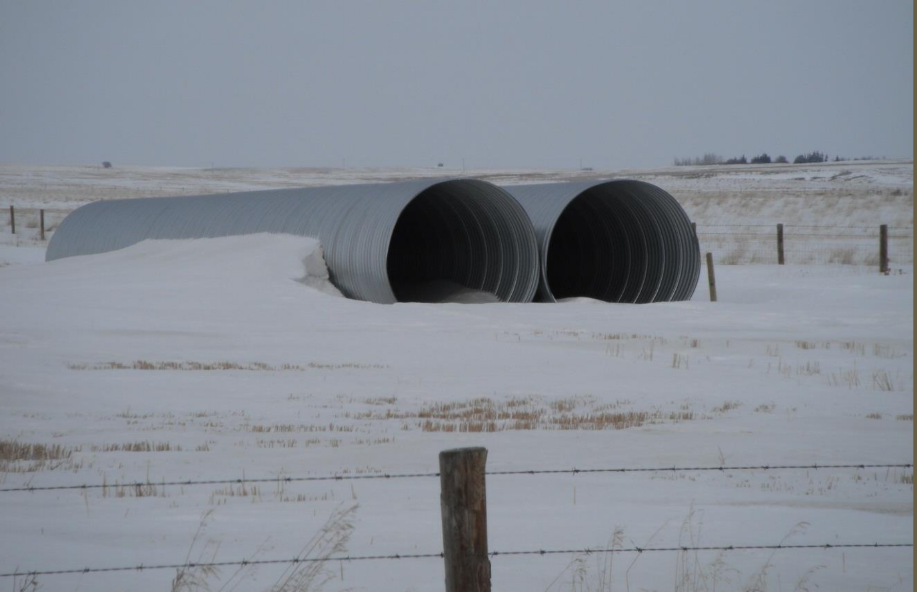
Culverts ready for Bradley Bridge