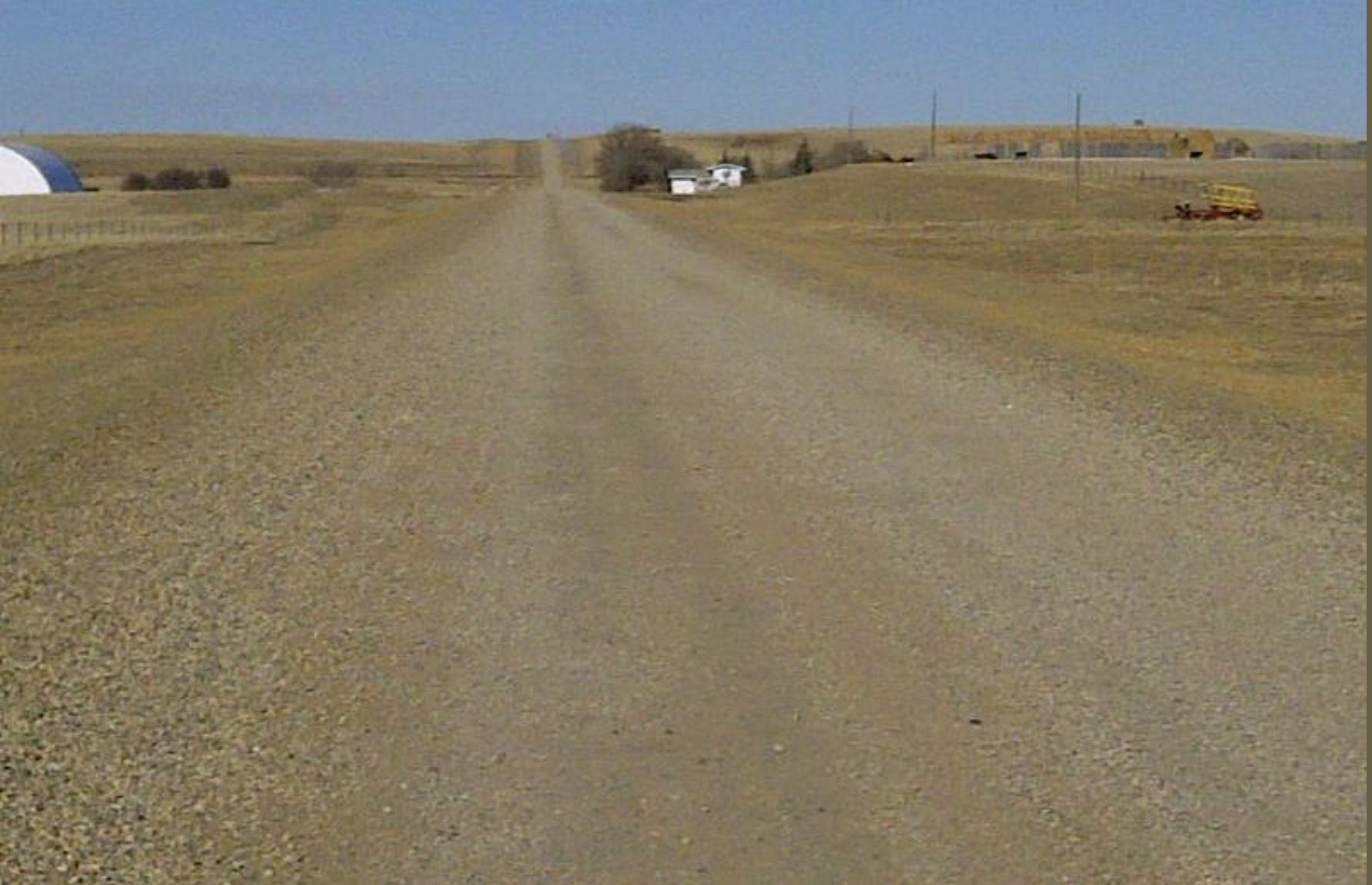
Adlem Road after construction, looking North