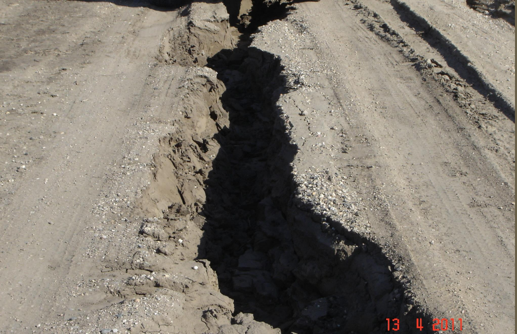
Road north of George Harvey's before shoulder pull