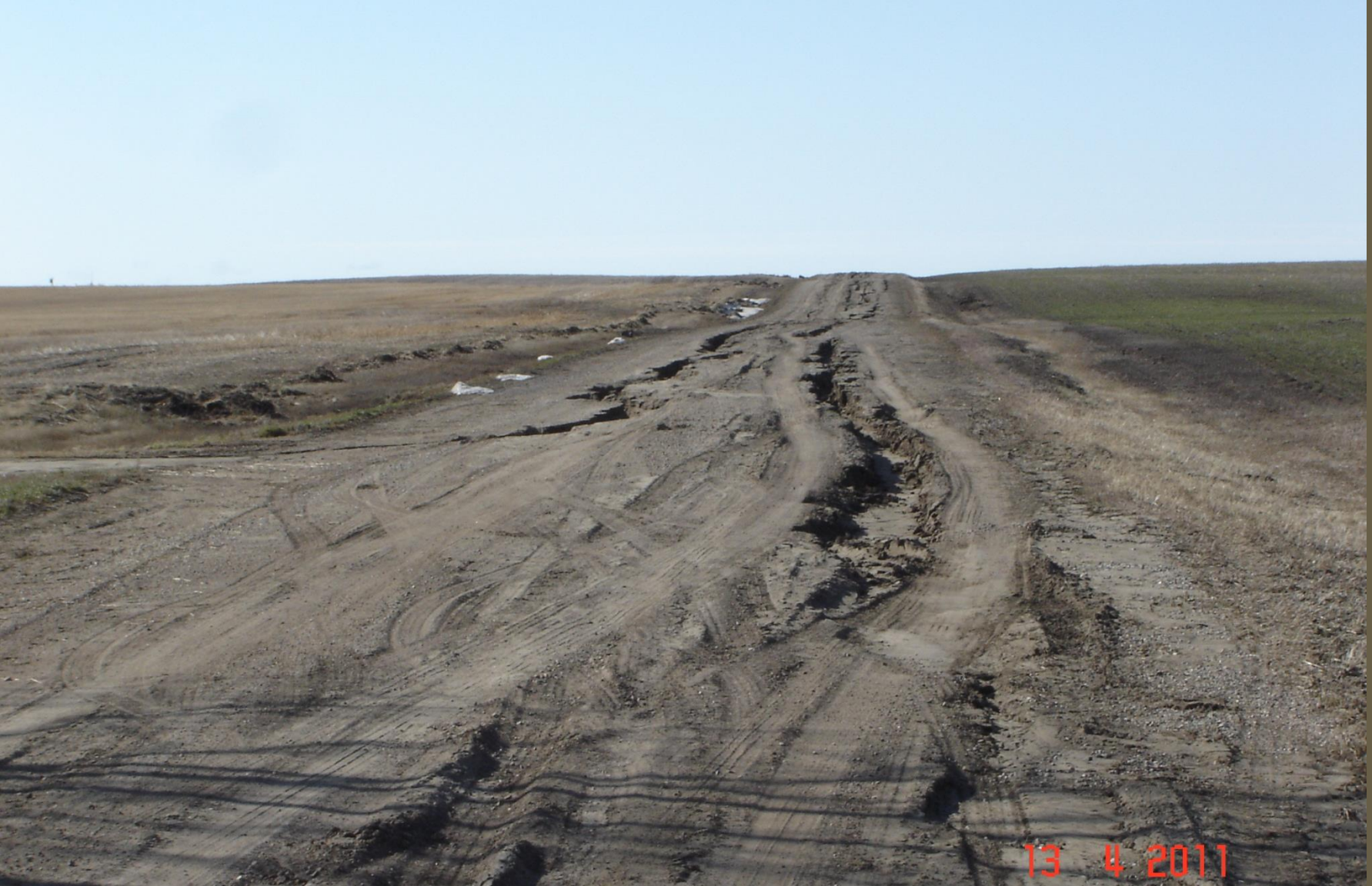
North of George Harvey's before shoulder pull