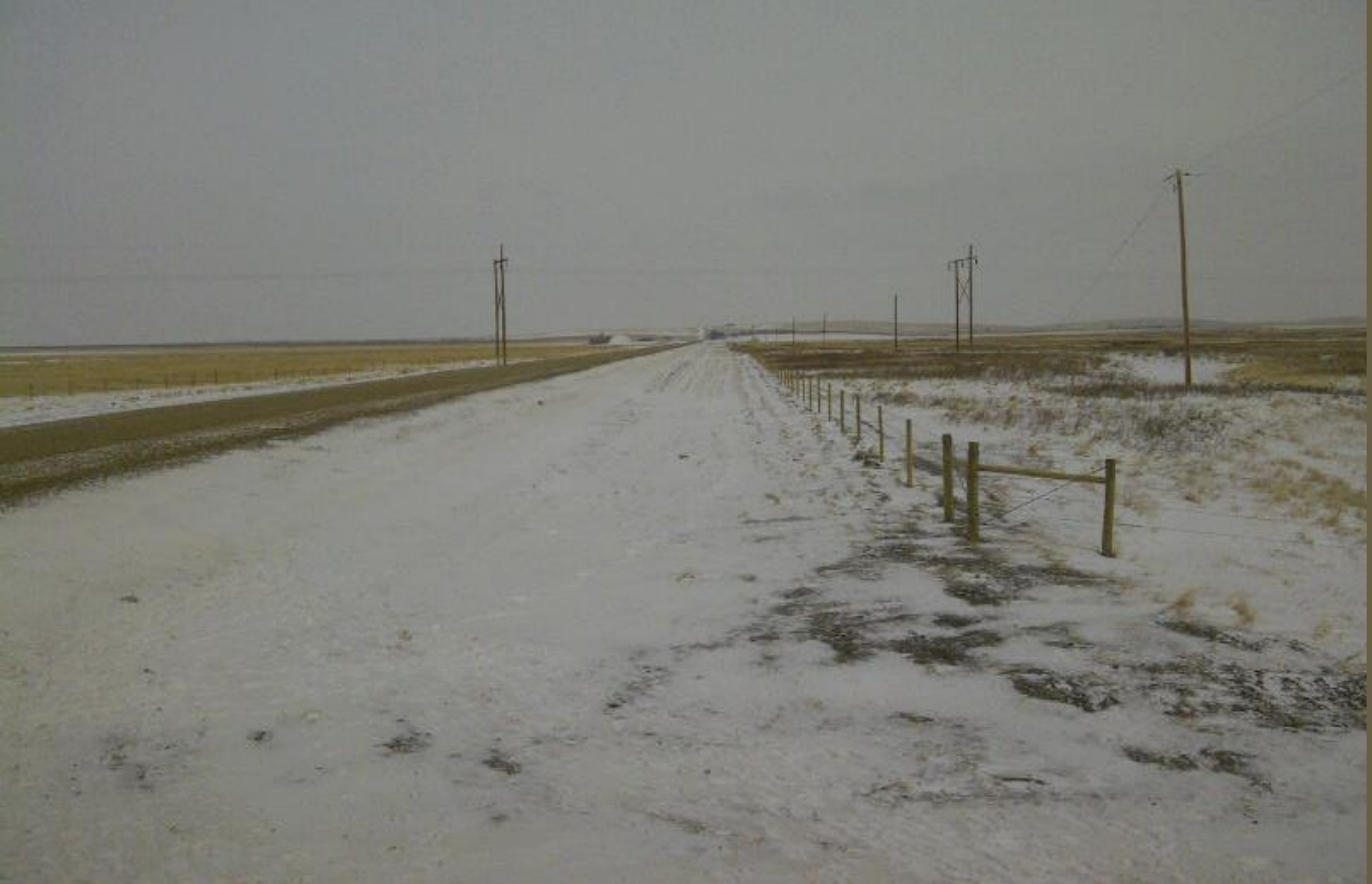
Looking North from South Boundary