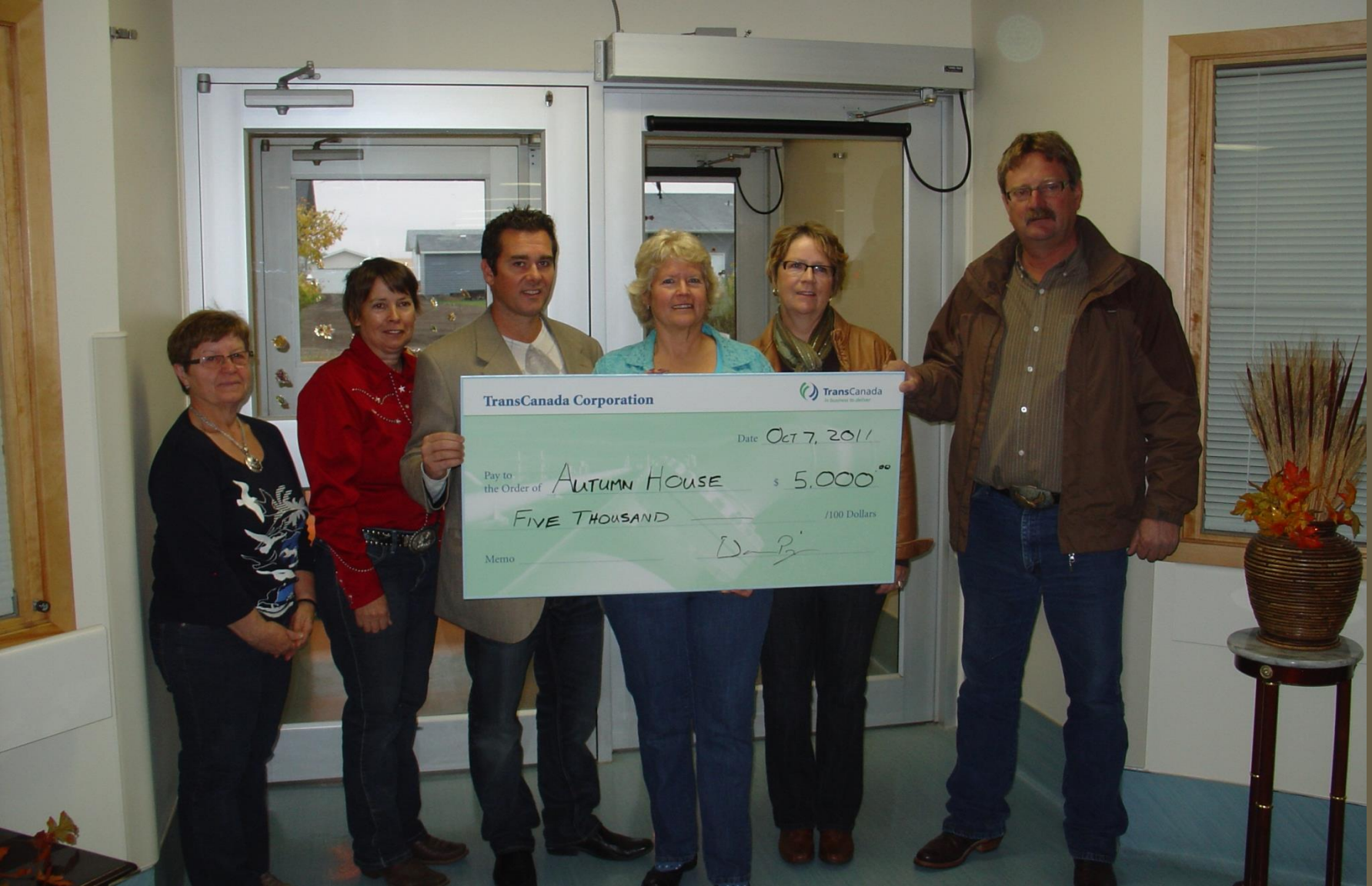
TransCanada Keystone donated $5,000.00 to Autumn House