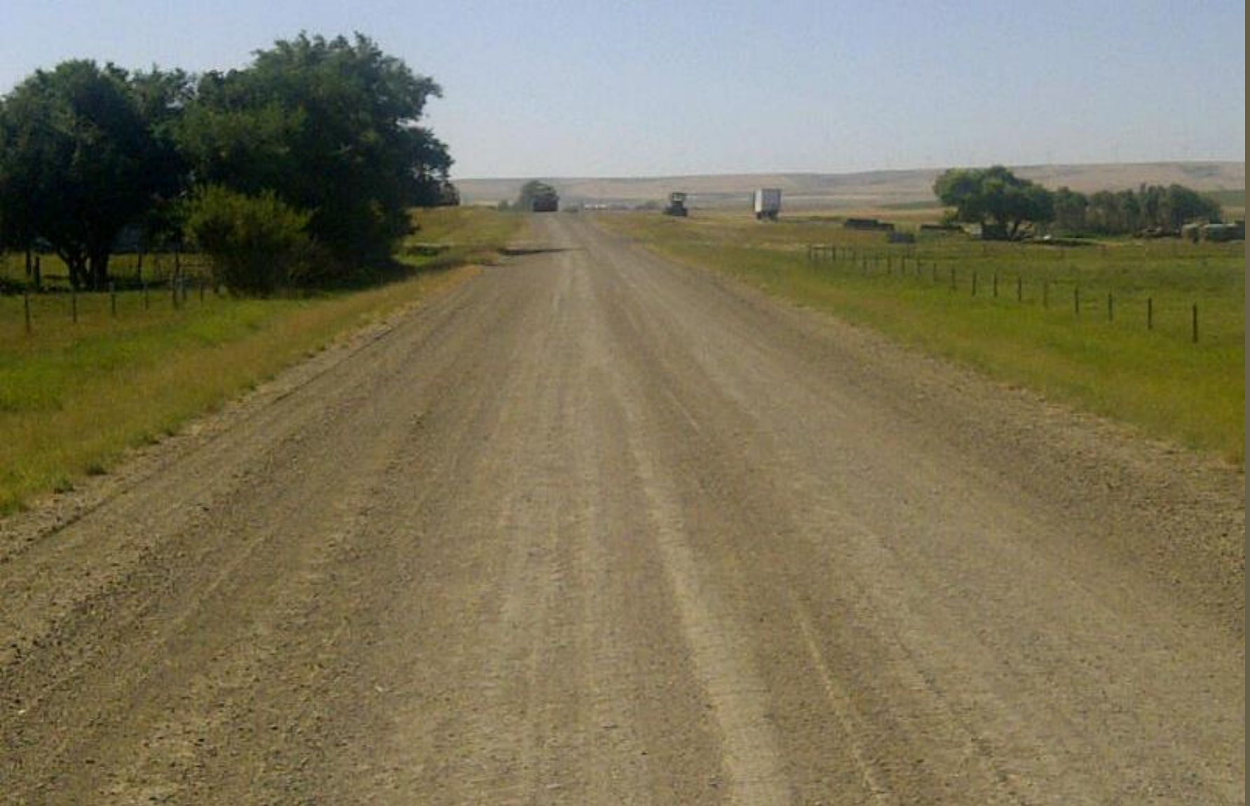
Adlem Road before construction, looking south