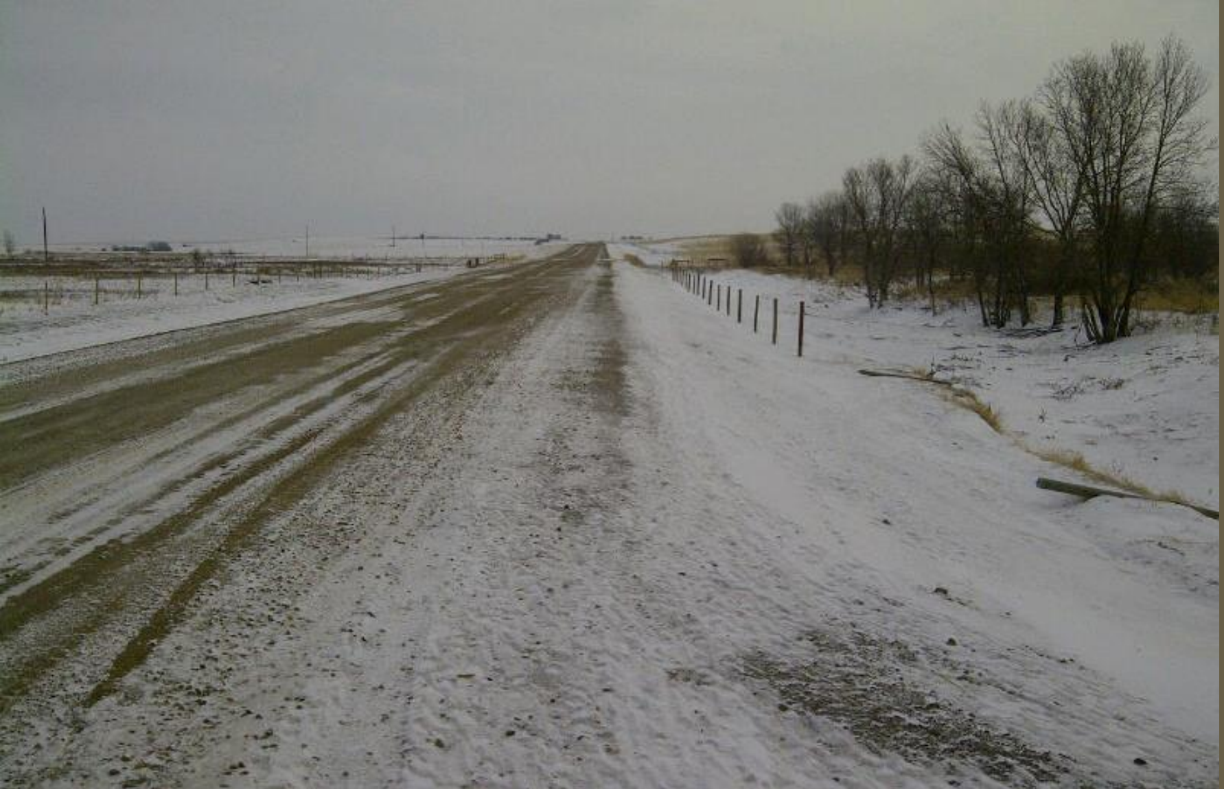
Looking East from ditch block