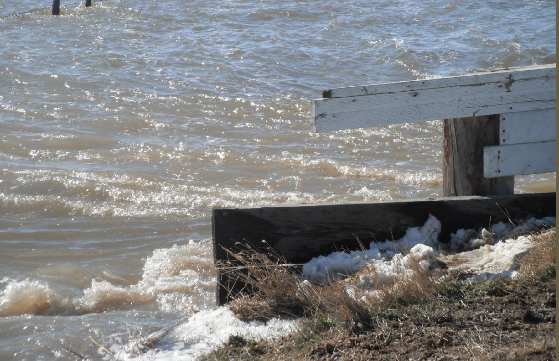
Bradley Bridge closer view