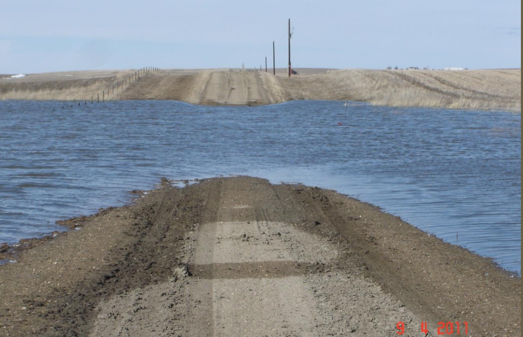
Back road by Martindale's