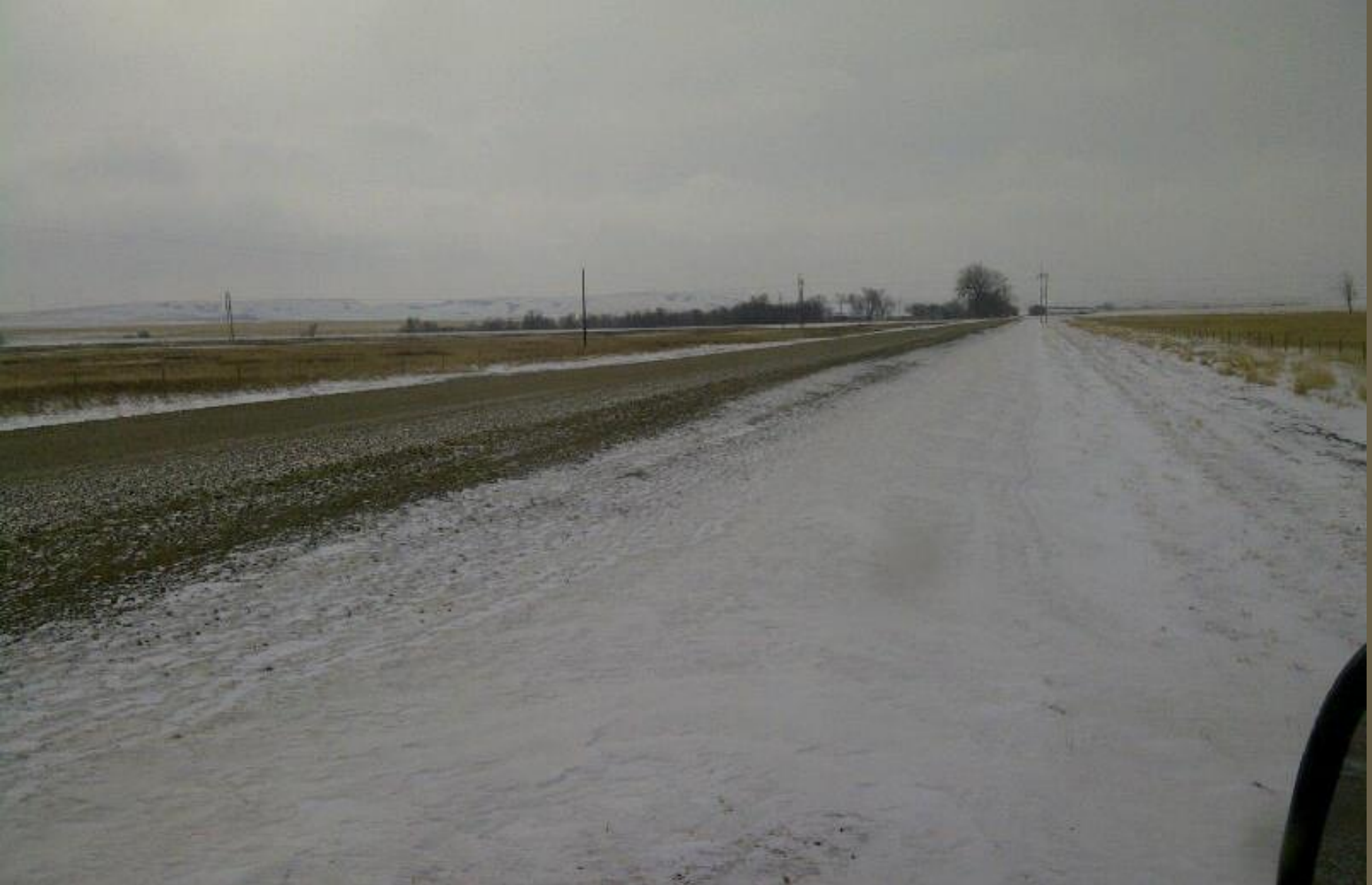
Looking South from old rail bed