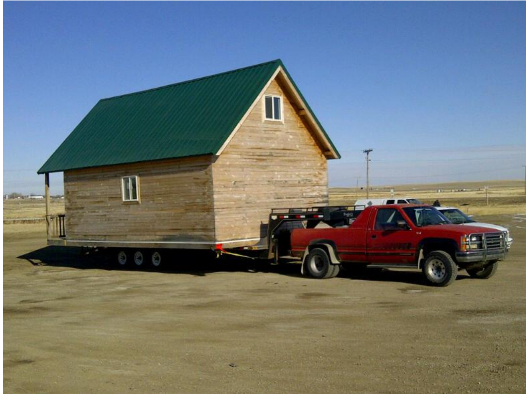
R.M. Piapot Reeve's new fifth wheel camper!