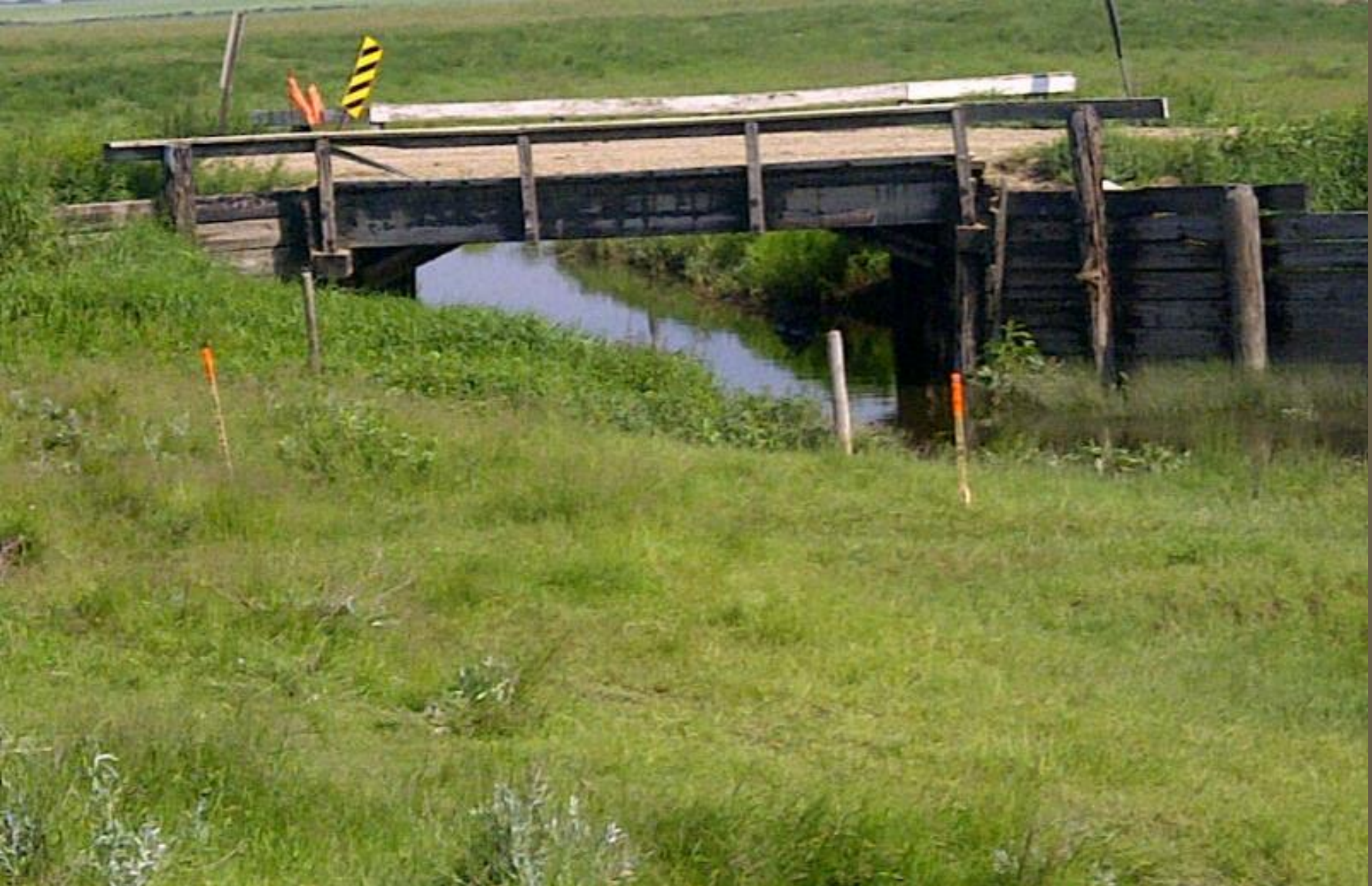
View of Bradley Bridge before construction