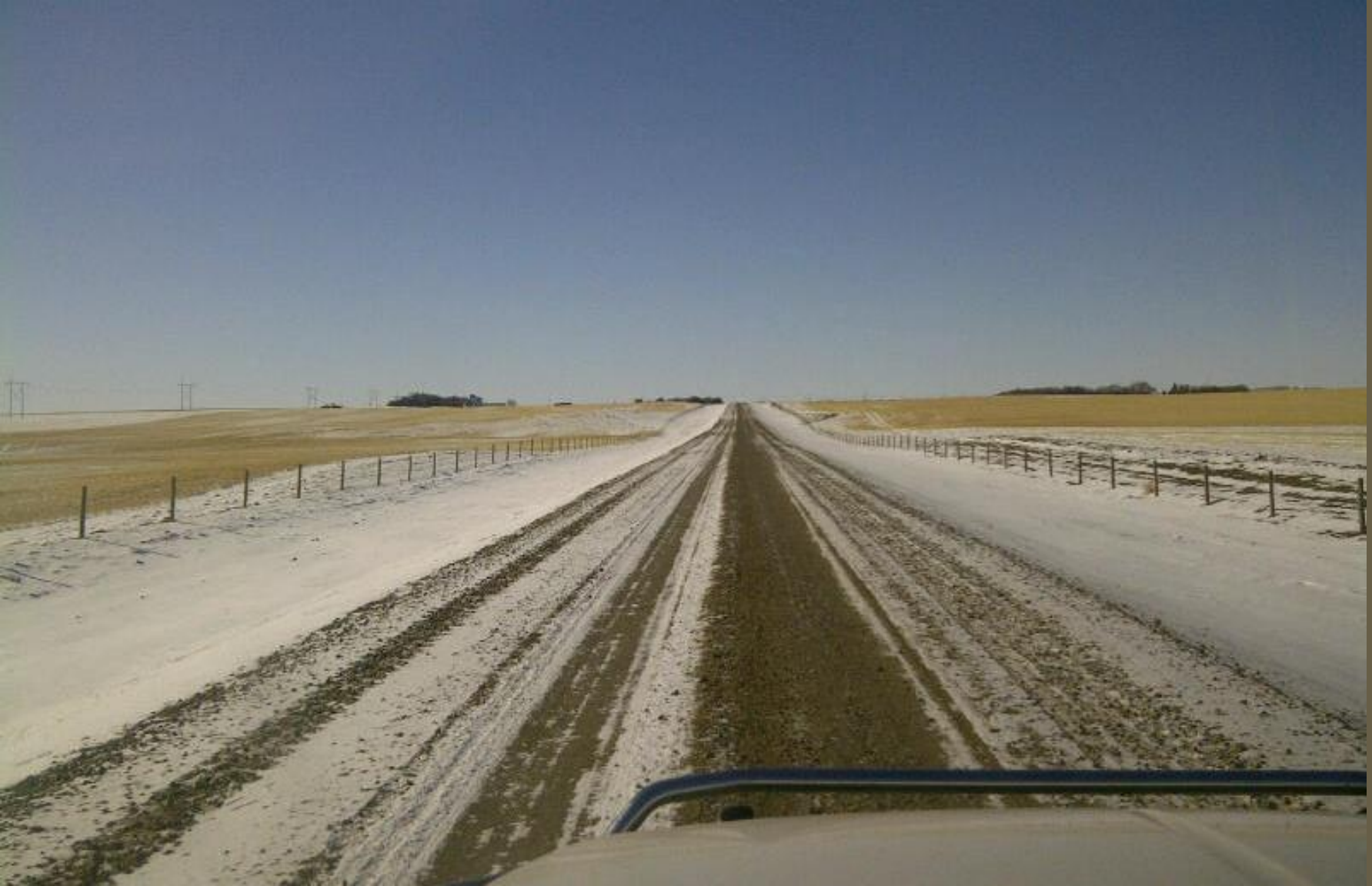
New Bradley Road