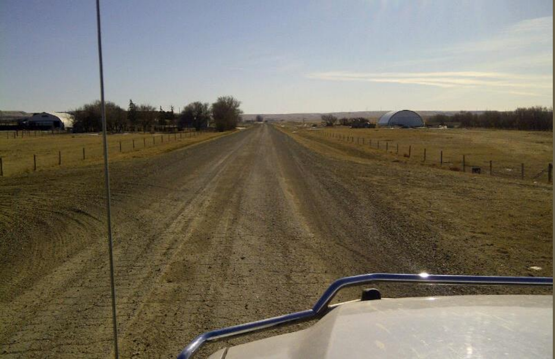
Adlem Road after construction, looking South