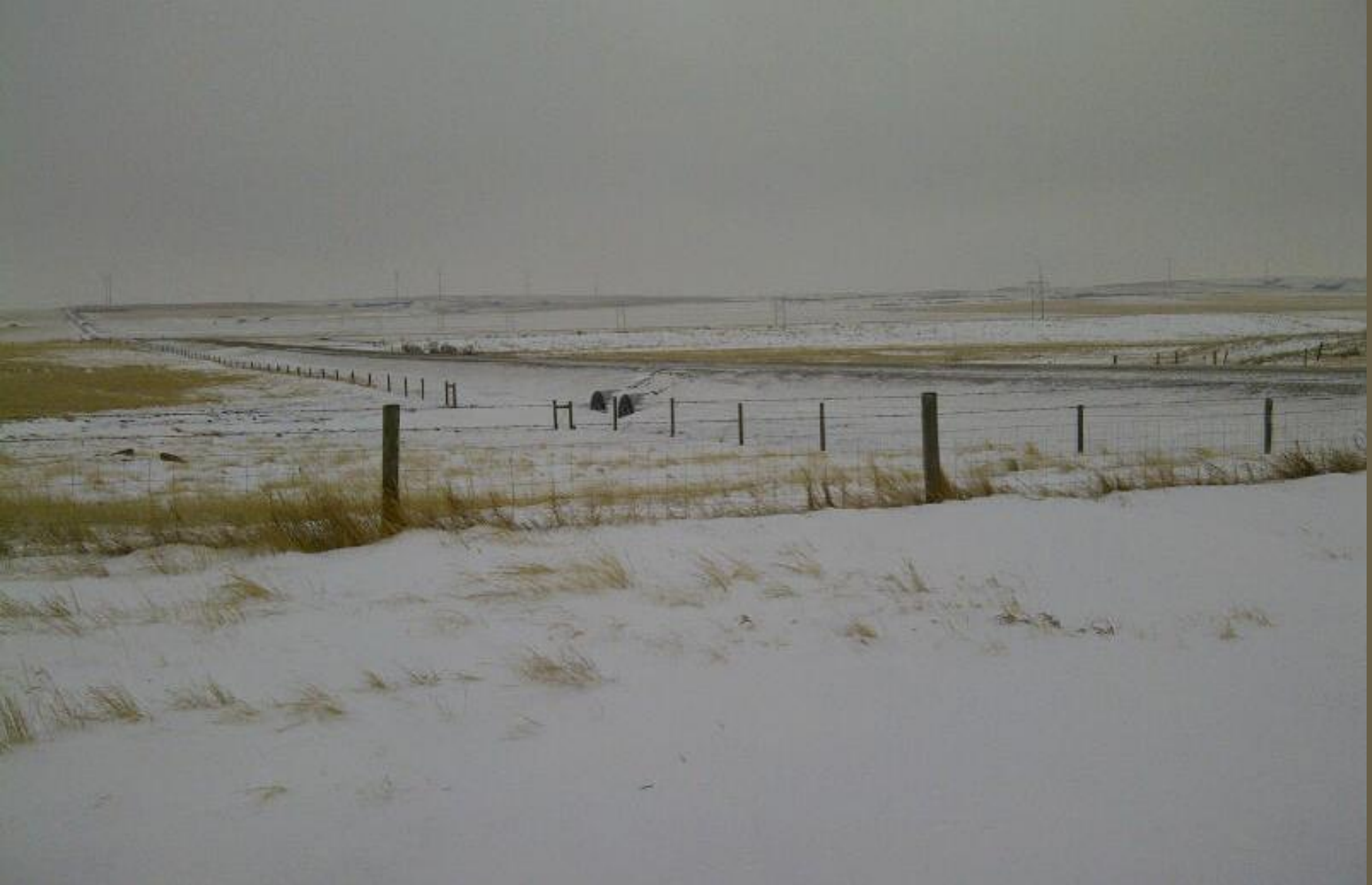
Bradley bridge after installation