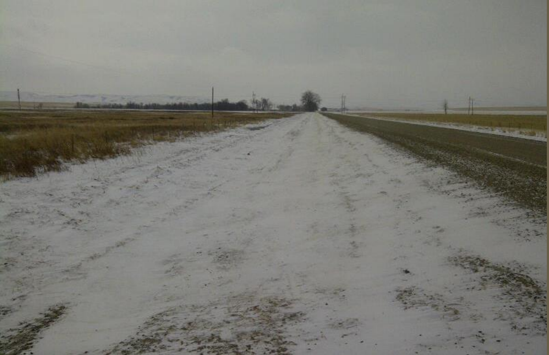
Looking South from old rail bed